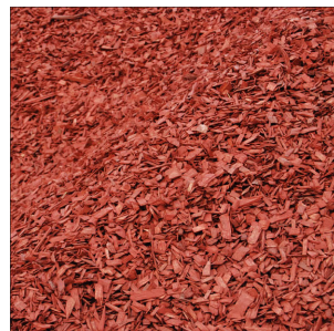
Red Wood Chip