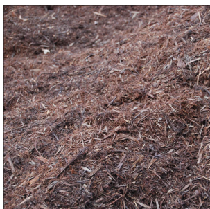
Cypress Pine Bark