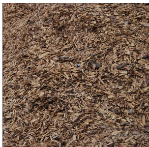
Cypress Pine Chip