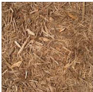
Lucerne Nutri Mulch